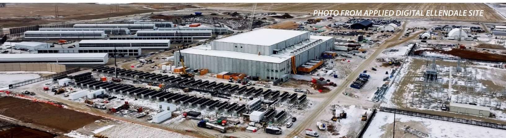
PHOTO FROM APPLIED DIGITAL ELLENDALE SITE

We are proud of the strides we've made and look forward to continuing to support our community's connectivity needs. Thank you for being a part of DRN's journey.